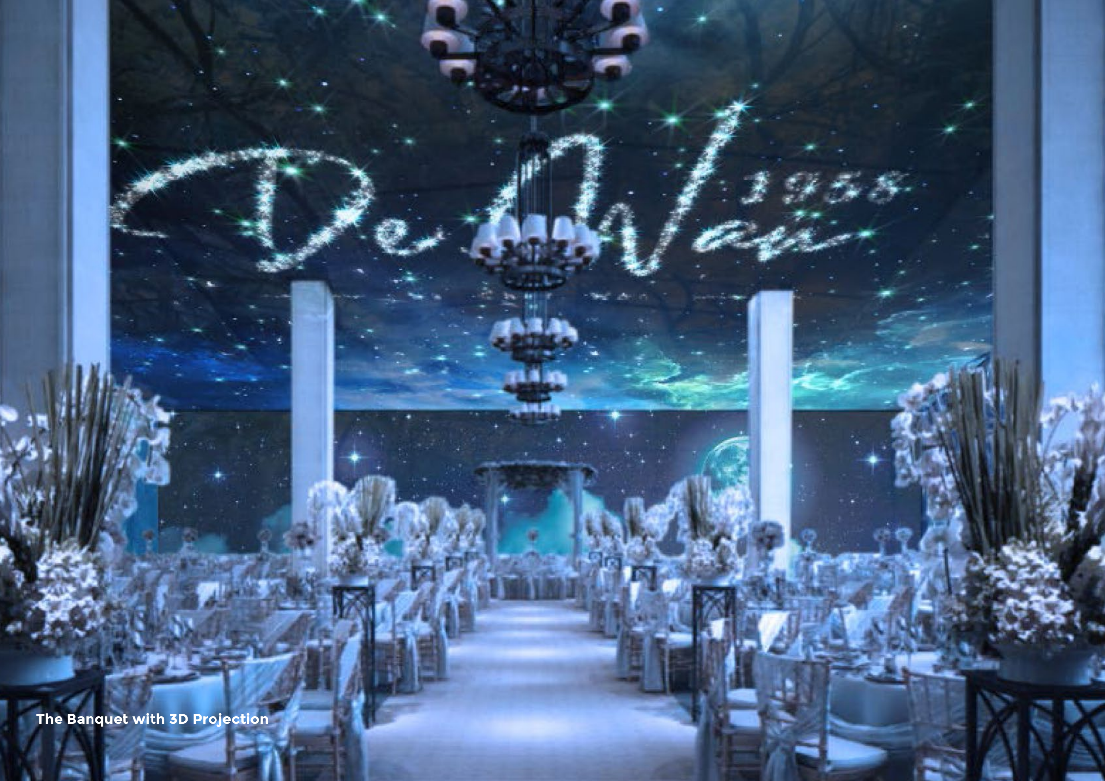
The Banquet with 3D Projection