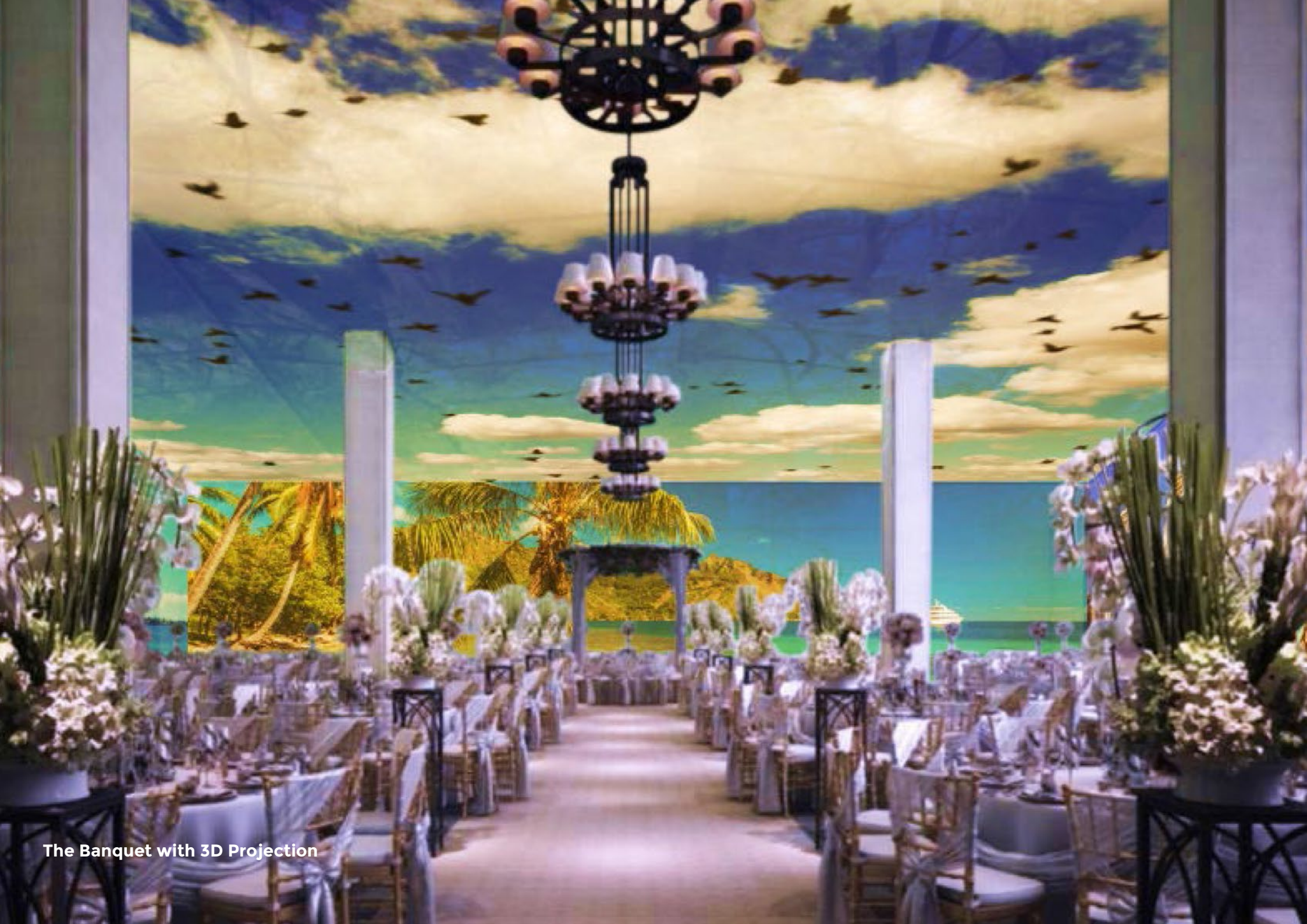
The Banquet with 3D Projection