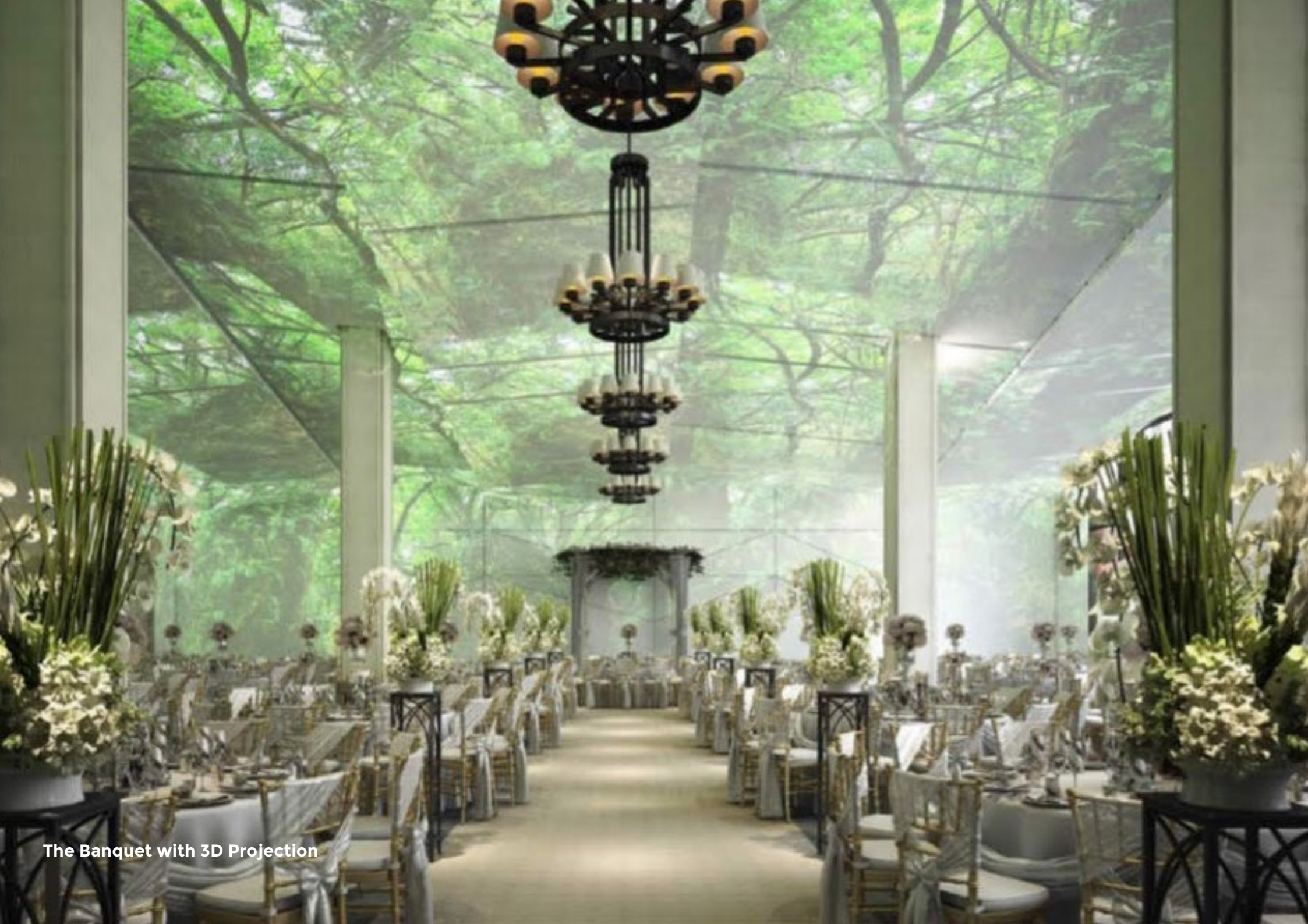
The Banquet with 3D Projection