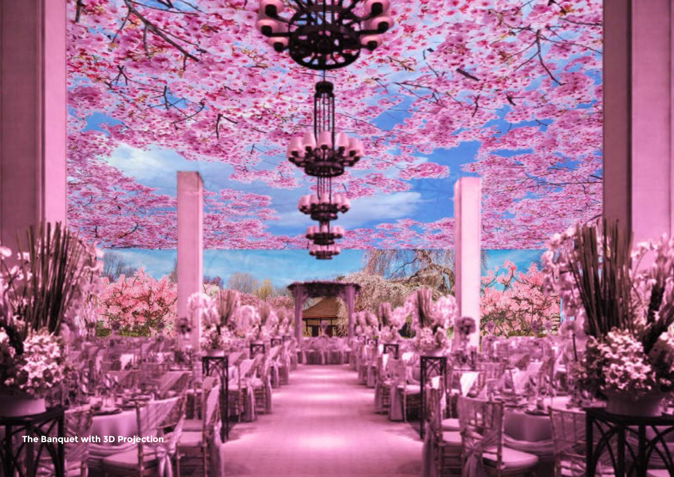
The Banquet with 3D Projection